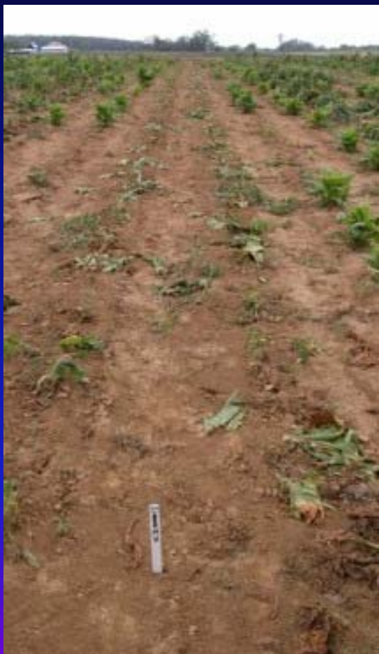
Machine harvested 2 rows

2008 – UKREC, Princeton, KY – Following Pick Up