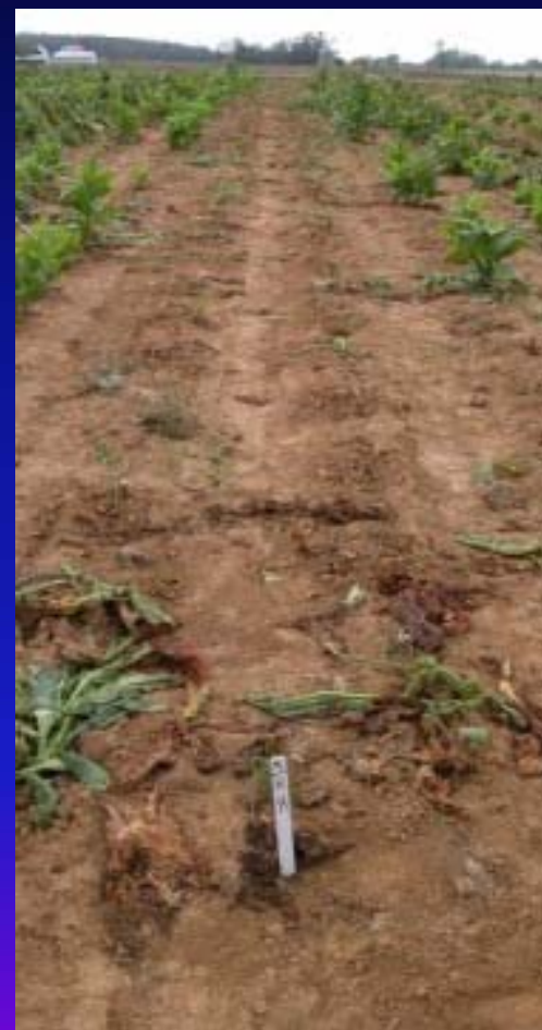
Hand Harvested 2 rows