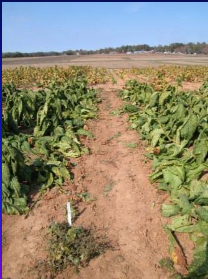
Machine harvested 2 rows

2008 – UKREC, Princeton, KY – Following Cutting