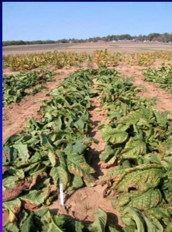
Hand Harvested 4 rows