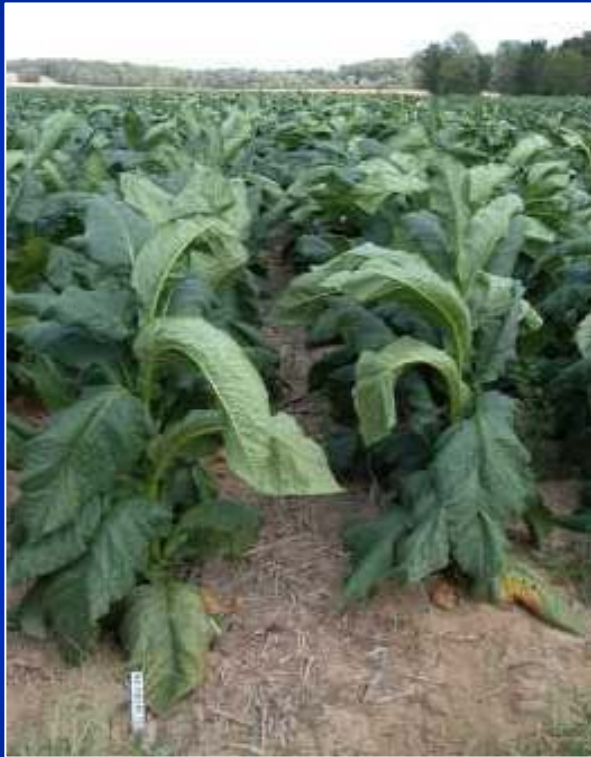
KY 171 August 21