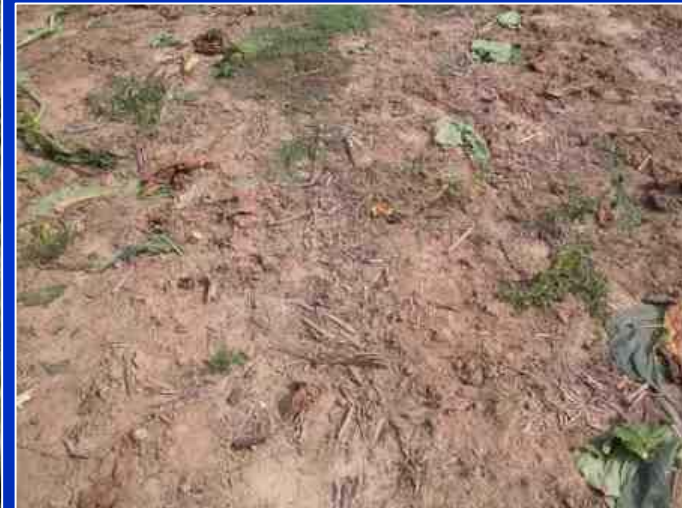
Residue levels following harvest