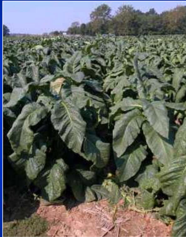
KY 171 September 18