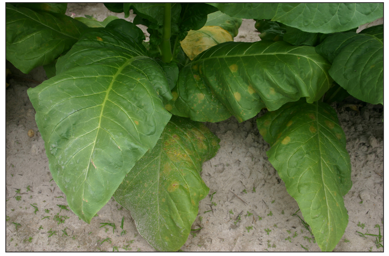
FIGURE 2. ORANGE-YELLOW LESIONS ON TOP SURFACES OF TOBACCO LEAVES IN THE FIELD.

By using alternate modes of action, growers may preserve the efficacy of fungicides as powerful disease management tools for many growing seasons to come.